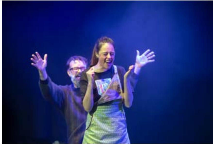
Image Description: Juniper is excited! She has her eyes squeezed shut and is smiling. Dad stands behind her. He is also excited and smiling.

Today you will be watching a play. It is not a movie. It is performed by actors right in front of you!