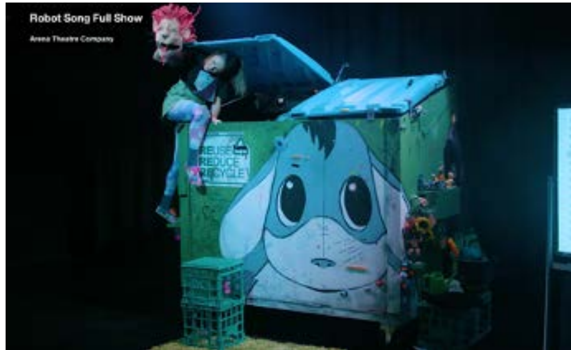
Image Description: Juniper jumps into the large, colourfully painted dumpster.

7. Juniper and Dad sing a song about a magic bin named "Gomi" that lives in their backyard. Gomi is Juniper's best friend and she finds interesting things inside the rubbish bin (dumpster) to play with.