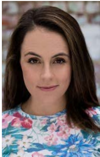
Image Description: A photo showing the head and shoulders of a brunette woman. She wears a blue floral top and smiles at the camera.

Below are photos of the actors with the names of the characters they play.