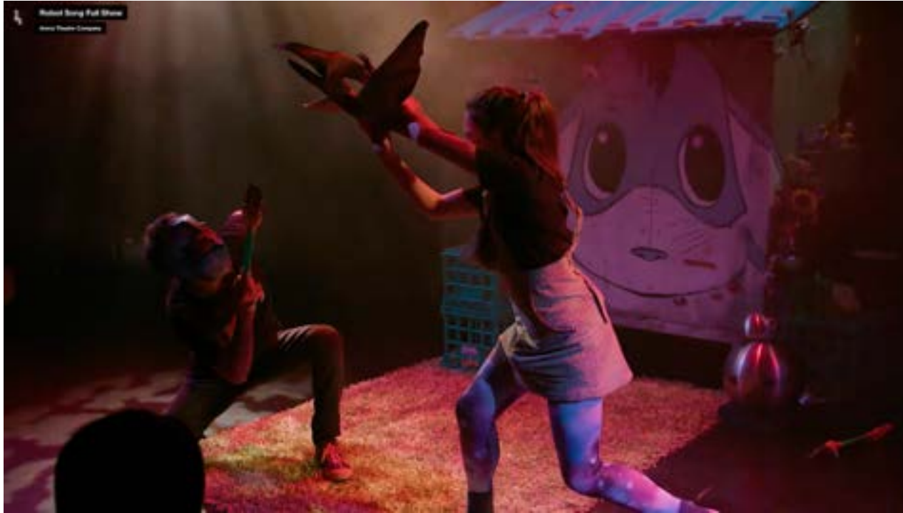
Image Description: Dad and Juniper play fight. She is a pterodactyl and he is a toy robot.

In one scene Dad and Juniper have a play battle with Dad dressed as a robot and Juniper flying a pterodactyl.