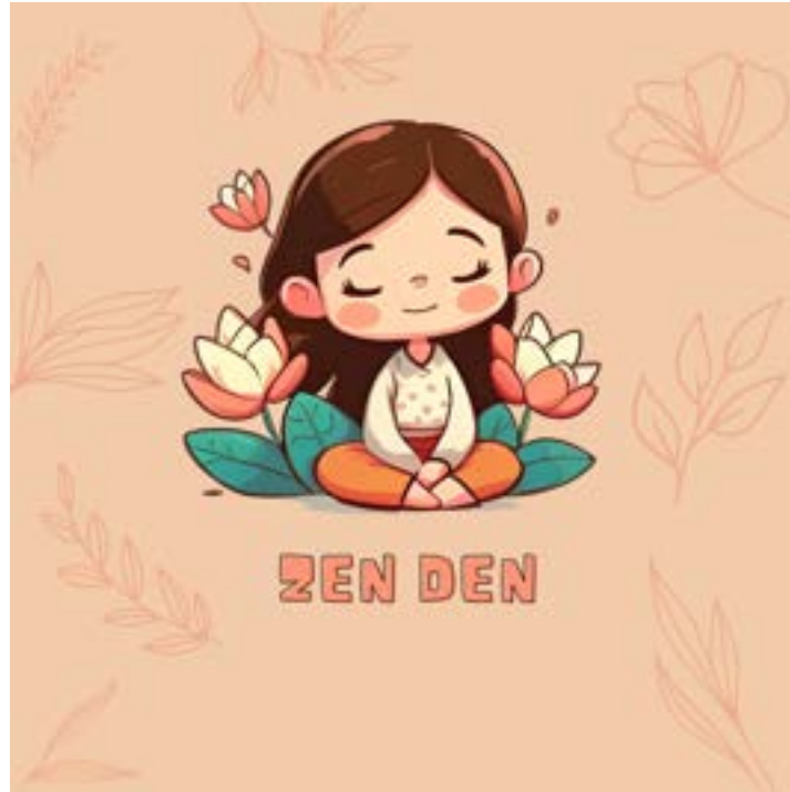
Image description: A poster with a beige background. On it is a cartoon image of a young person sitting in the centre. They are crossed legged and smiling with their eyes closed. Below the person it reads: Zen Den

If it is loud or overwhelming in the play or the lobby I can use Zen Den space.