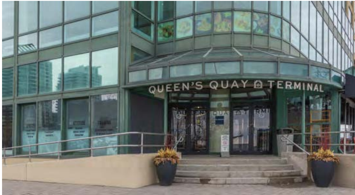
Image Description: The outside of the Queen's Quay Terminal building (southwest corner).

The play will be in the Fleck Dance Theatre. The Fleck Dance Theatre is inside the Queen's Quay Terminal.