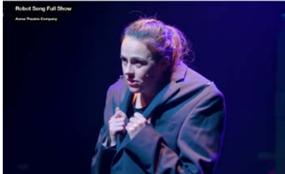
Image Description: Juniper is dressed up in an oversized suit jacket.

10. Juniper pretends to be the principal Mr. Scryber on the day she receives the letter. The principal explains that Juniper pushed a child off her chair and her arm was broken. Juniper was upset that the kids in her class wrecked the VHS video cassettes that she brought to school. Juniper has stopped going to school because she was so hurt by the letter. Juniper sings a song about her school.