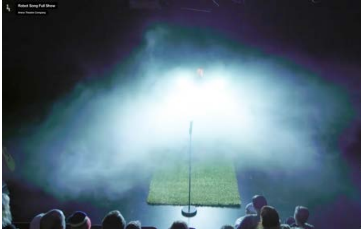
Image Description: A microphone is on stage. A light shines towards the audience. There is smoke on the stage.

There are some scenes where haze is used. Theatre haze is a vapour, not a smoke. It is safe and does not irritate eyes or throats.