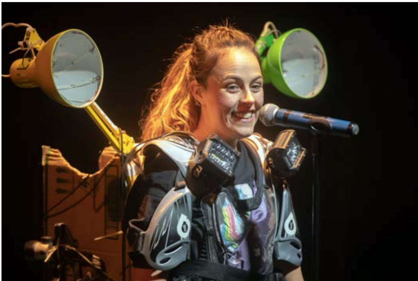
Image Description: A girl dressed as a robot stands and smiles widely.