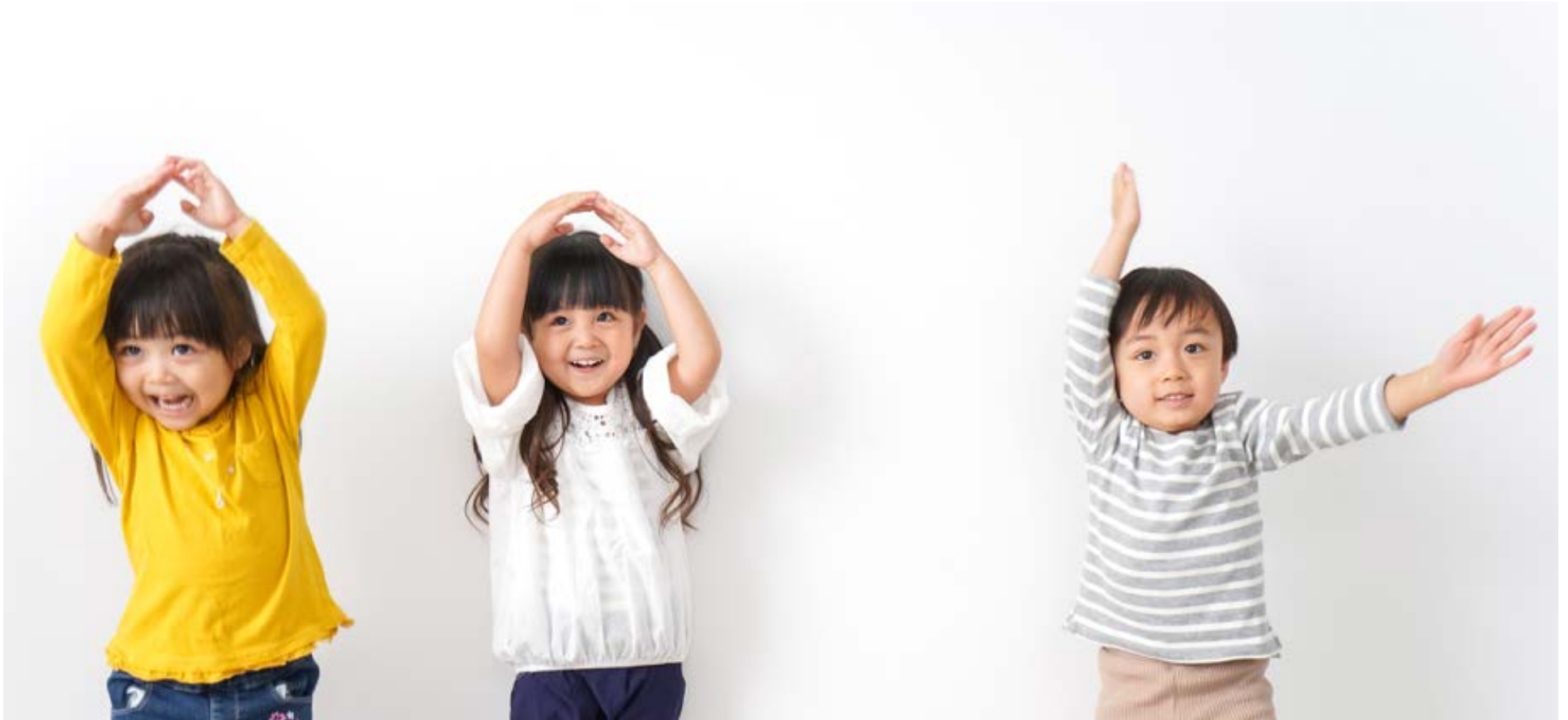
Image Description: Three children are dancing in front of a light grey wall.

I can do what I need to enjoy it more - I can doodle, fidget, stim, dance, move, vocalize, sit, lay, talk, and more! I can be me!