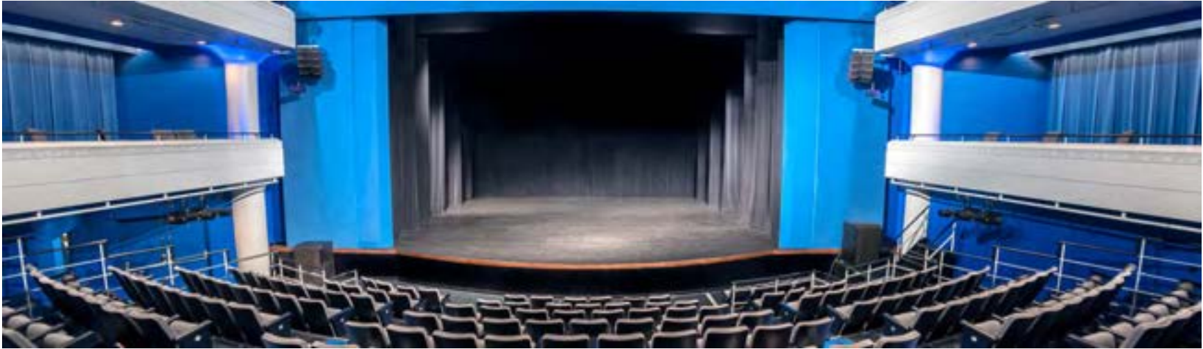
Image Description: Inside the Fleck Dance Theatre looking at the stage from the back of the orchestra level seating.

When we enter the theatre I can sit in my seat. The seating is fixed, this means the chairs do not move.