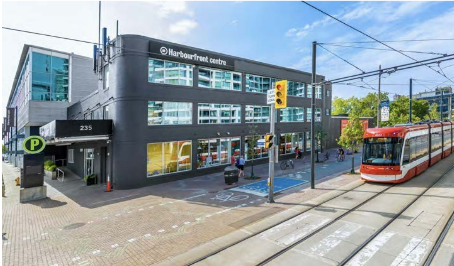
Image Description: This is an image of the 510 Spadina streetcar stopping outside of Harbourfront Centre going east to Union Station.

If we take the streetcar we will get off at the Harbourfront Centre stop.