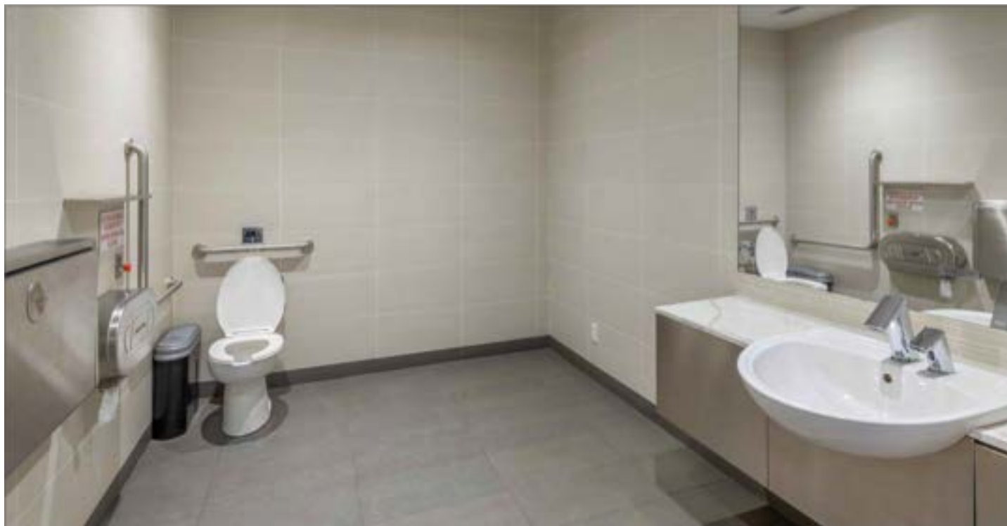
Image Description: The accessible washroom at the Queen's Quay Terminal

The accessible washroom is on the main floor of Queen's Quay Terminal. If I need to use the accessible washroom I can use it before going upstairs to the theatre.