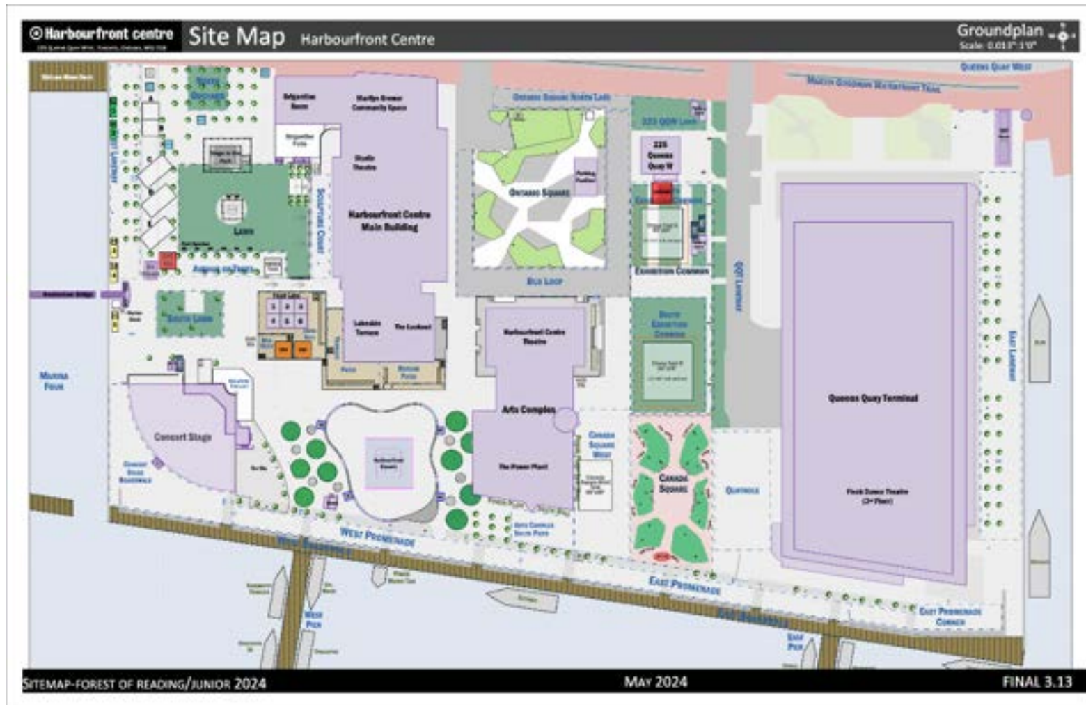
Image Description: A map of the Harbourfront Centre campus that includes the Queen's Quay Terminal.