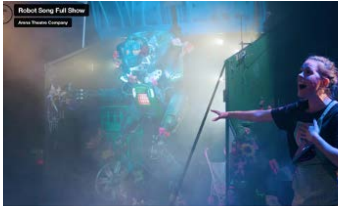
Image Description: Juniper points with her arm. There are bright lights where she is pointing.

14. Juniper invites Battletec to come live with her and her family inside Gomi in the backyard. Gomi opens up and reveals the large robot inside. Battletec talks to the audience.