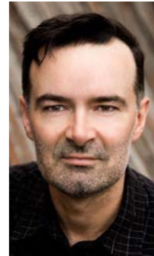
Image Description: A photo showing the head and shoulders of a man with brown hair. He wears a dark top and looks at the camera.

She plays the Juniper and Principal Scryber.