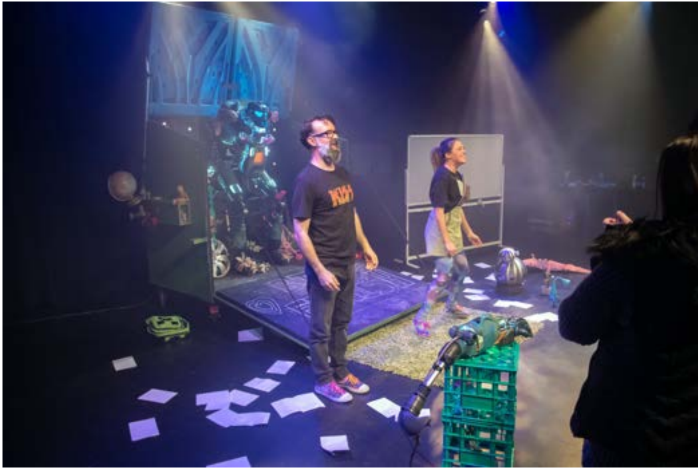
Image Description: Juniper and Dad are on stage. There are papers and robot parts scattered around them. A robot is behind them. Both Juniper and Dad look excited and happy.

The play I am going to see is called Robot Song. It is from Australia.