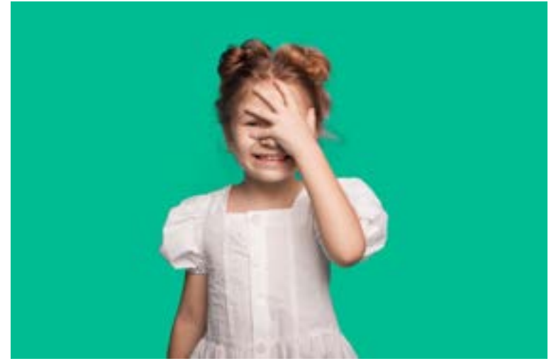
Image Description: In the first photo a boy wearing sunglasses and a white t-shirt stands in front of a blue background. In the second photo a young girl wearing a white top covers her eyes and peeks through her fingers. She is smiling.

If it is too bright during the play I can wear sunglasses or I can cover my eyes - whichever feels best for me.