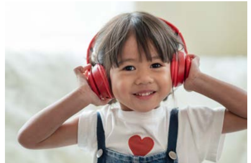
Image Description: In the first photo a young girl covers her ears with her hands. In the second photo a young person has on red sound dampening headphones. Both are smiling.

If the show is too loud I can cover my ears with my hands, or wear sound dampening headphones - whichever feels best for me.