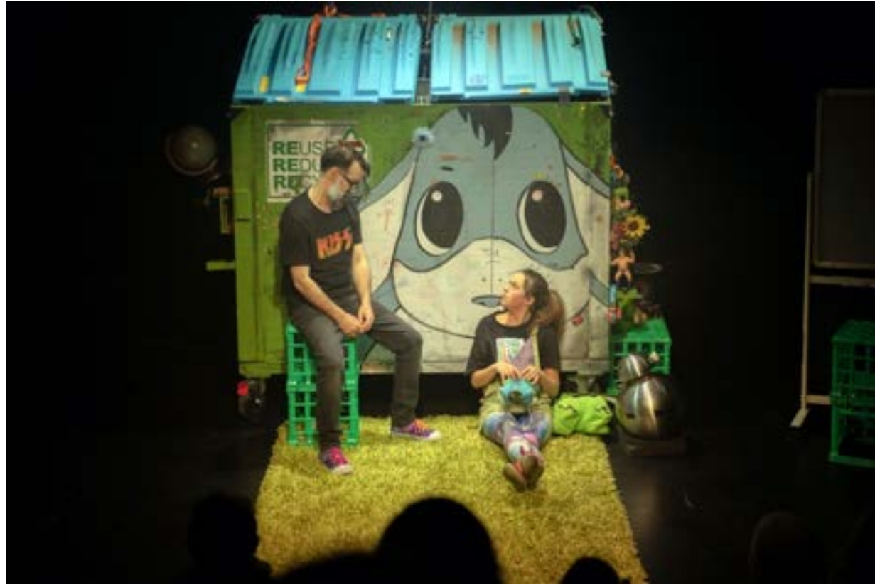
Image Description: Two people sit on stage, a large colourfully painted dumpster is behind them.