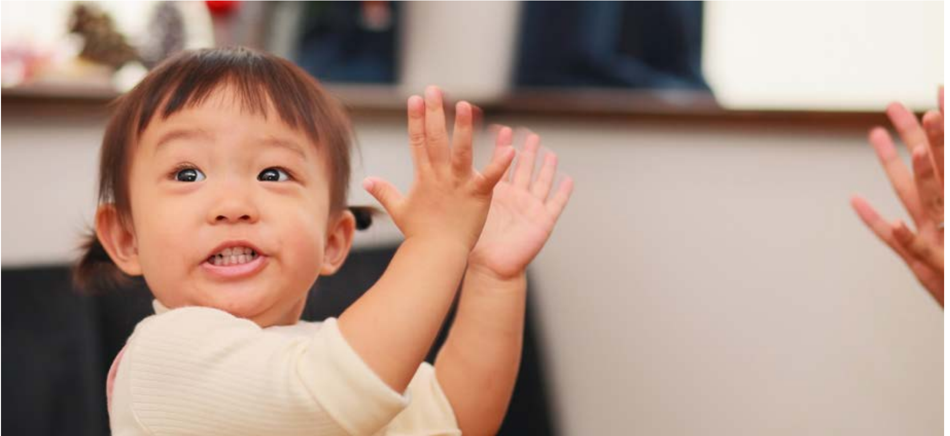
Image Description: A small child claps their hands and looks happy.

At the end of the play, I can show the actors how much I liked it by clapping, saying “Bravo” and by using any other way that feels good for me.