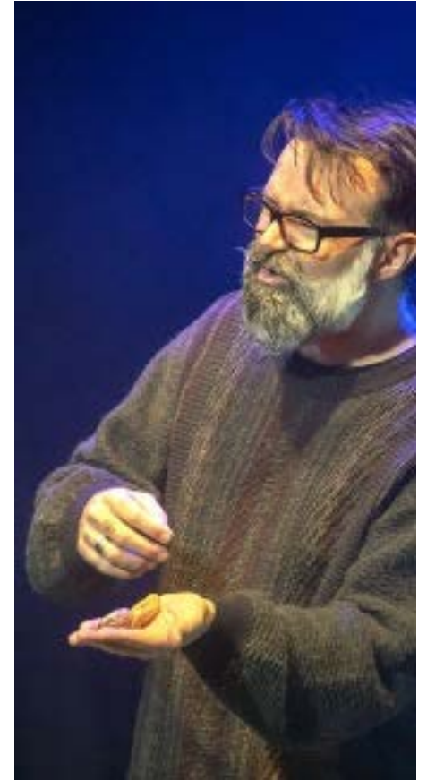
Image Descriptions: Three photos of Dad. He looks at the carpet and then something in his hand. He sees, and then holds, poo.

In one scene Dad talks about finding something under a container on the carpet.