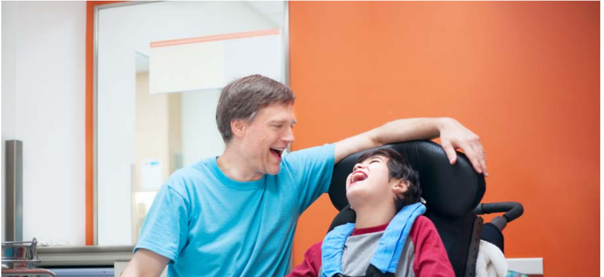
Image Description: A boy in a mobility device laughs. A man sits beside him and is also laughing.

During the show I can clap, laugh, smile, and feel any way that the show helps me to feel.