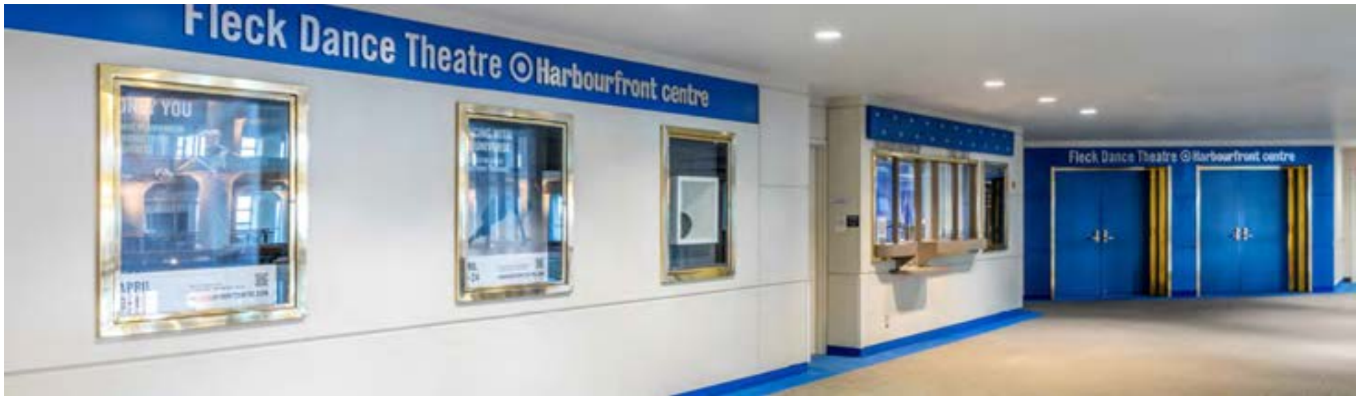
Image Description: The Fleck Dance Theatre lobby. The doors to the lobby are blue.

When I reach the third floor I will be at the Fleck Dance Theatre. Once we have arrived at the theatre we can go inside and wait in the lobby if we like. We can also go inside to use the washrooms.