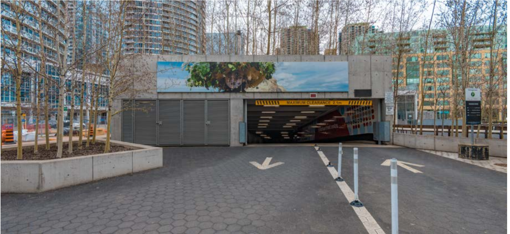
Image Description: A photo of the entrance to the Harbourfront parking lot off of Queens Quay.

If my family drives, we can park at the underground parking lot by Harbourfront Centre.