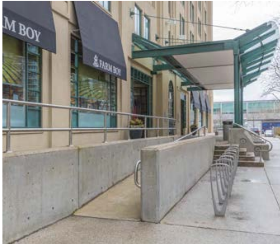
Image Description: The doors to the Queen's Quay Terminal building (north east entrance).

There are many entrances to the Queen's Quay Terminal.