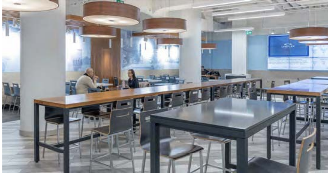
Image Description: Inside Queen's Quay Terminal, a cafeteria type set-up with tables and chairs.

Depending which entrance I use to enter Queen's Quay Terminal I will either come up to an info desk, a cafeteria or I will pass some restaurants.