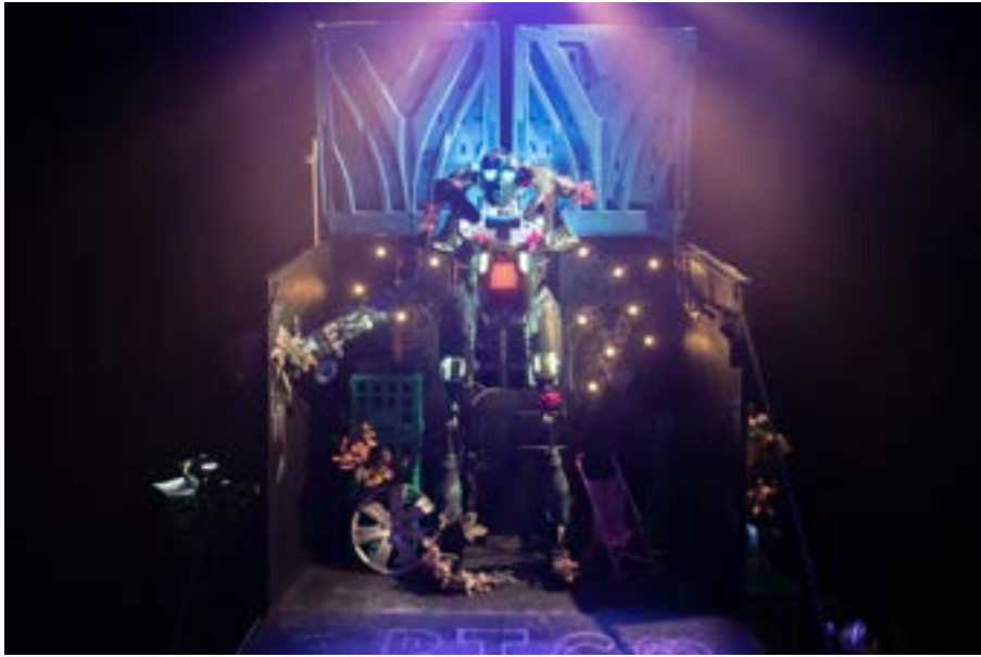
Image Description: A large robot is on a dark stage. There are lights shining behind and around it.

Thank you for watching Robot Song. We hope you enjoyed the show!