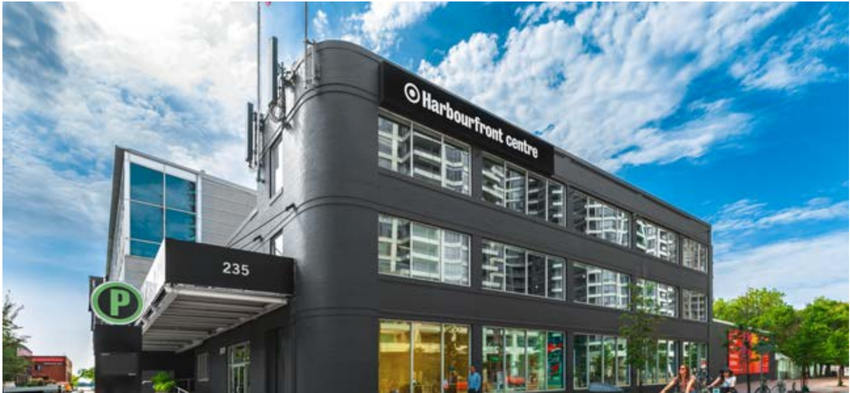
Image Description: The east entrance of Harbourfront Centre. The building is dark grey, has three floors and many windows.

I am going to see a play at the JUNIOR Festival at Harbourfront Centre.