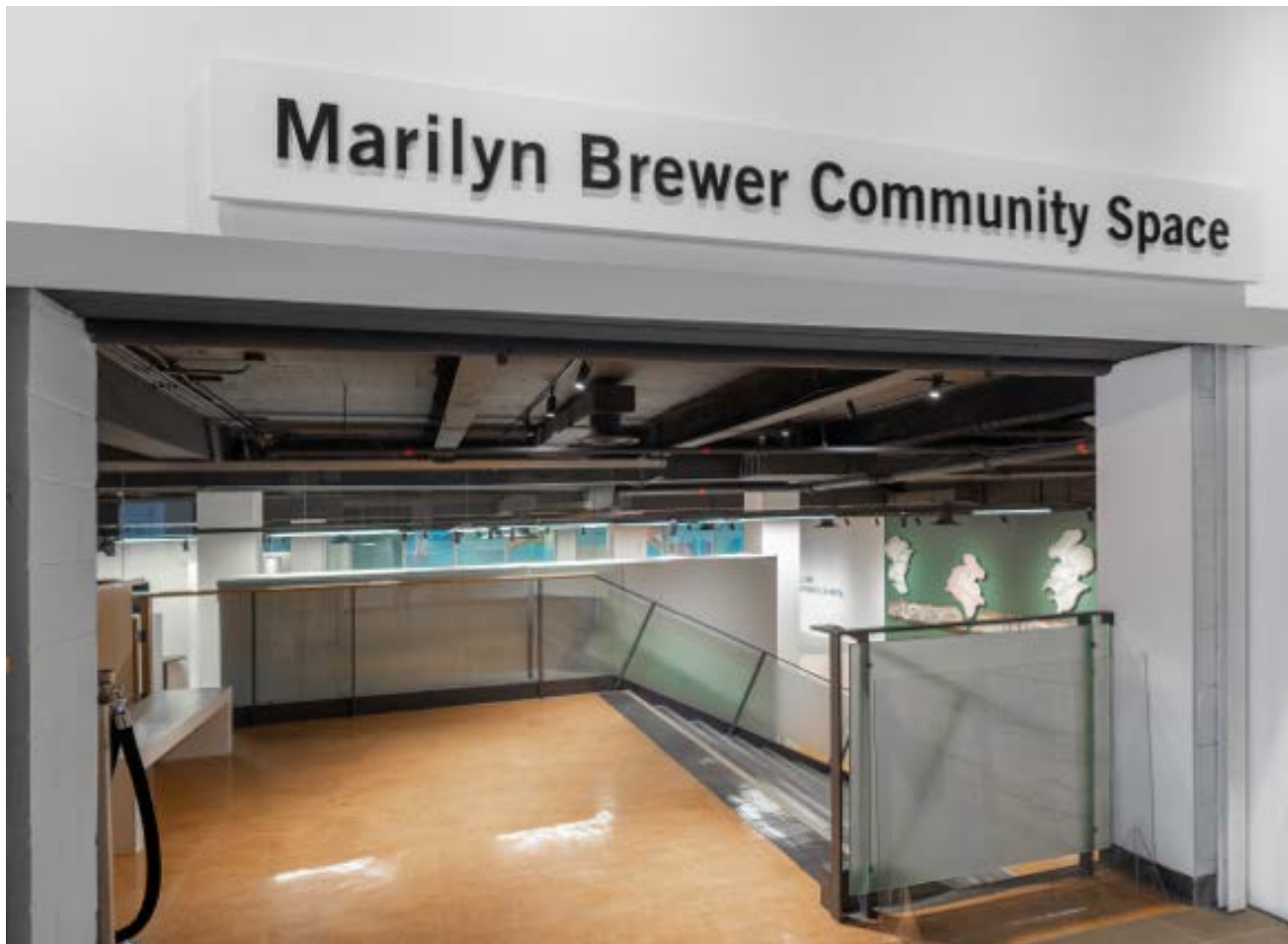
Image Description: The entrance to the Marilyn Brewer Community Space. There are stairs on the right that go down into the space. Many plays, events and performances are happening all over Harbourfront Centre during the Junior Festival. I can find out info on all the other Junior events here:

https://harbourfrontcentre.com/series/junior/