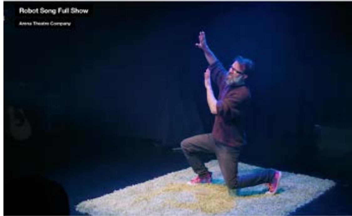
Image Description: Dad is kneeling and his hands are up to the right.