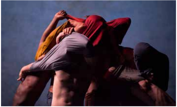
NÁSS by Fouad Boussouf